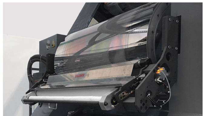
FilmCylinderCleaning installation in a film extrusion production line.

The cleaning system removes traces and deposits from the cylinder surface that may occur during the film extrusion process. A special long lasting lint-free microfilament cleaning cloth, the Baldwin FilmPac, absorbs the dirt and fluids from the cylinder surface without risk of scratching it – ensuring a continuous production with a consistent high film quality.